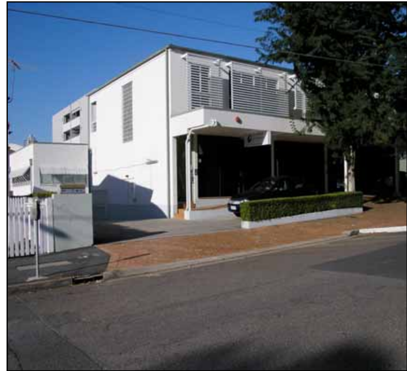
Head Office Manning Street South Brisbane

Learning Network Queensland was established in 1989 to expand the range of education and training opportunities offered to rural, regional and remote Queensland students from TAFES and Universities